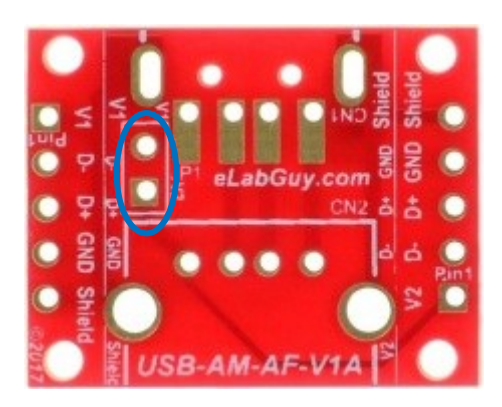
Figure 5: PCB front with open circuit on VCC pin in series