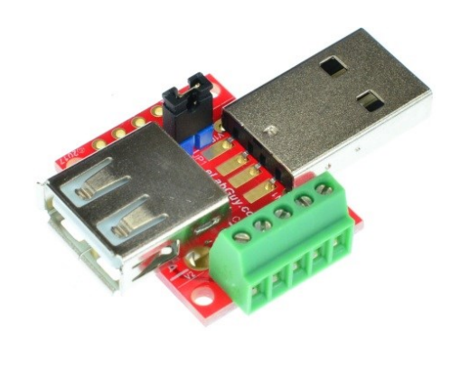
Figure 4: USB-AM-AF-V1A with terminal blocks